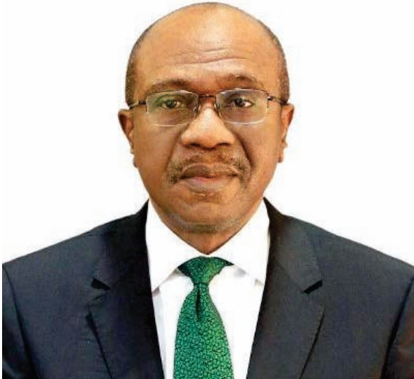
Mr. Godwin Emeziele Governor, CBN

The Central Bank of Nigeria (CBN) has assured Nigerians that the nation's banks are sound, healthy and safe. The CBN said it was important to ease the fears of Nigerians on the health of banks in the country.