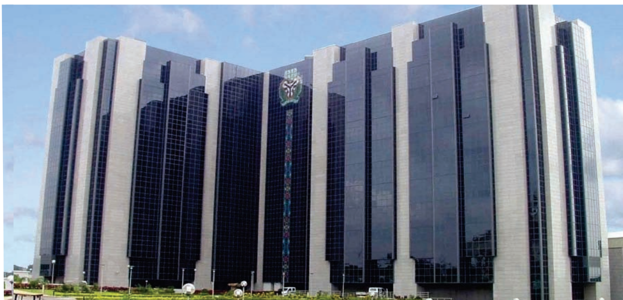
Central Bank of Nigeria, Headquarters